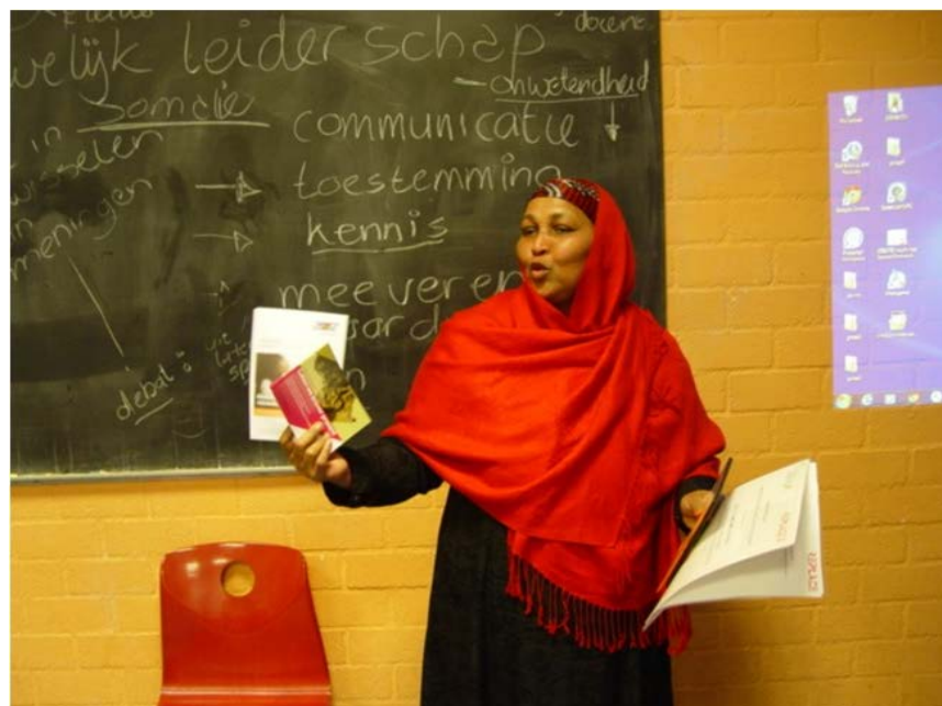
Training on women health, FGM and leadership in The Netherlands

One of the assignments given during the training for community women was to visit the Koran tutors of their own children and ask questions about FGM. The outcome was surprisingly positive , both male and female tutors, were willing to teach against FGM. The 13 women trained