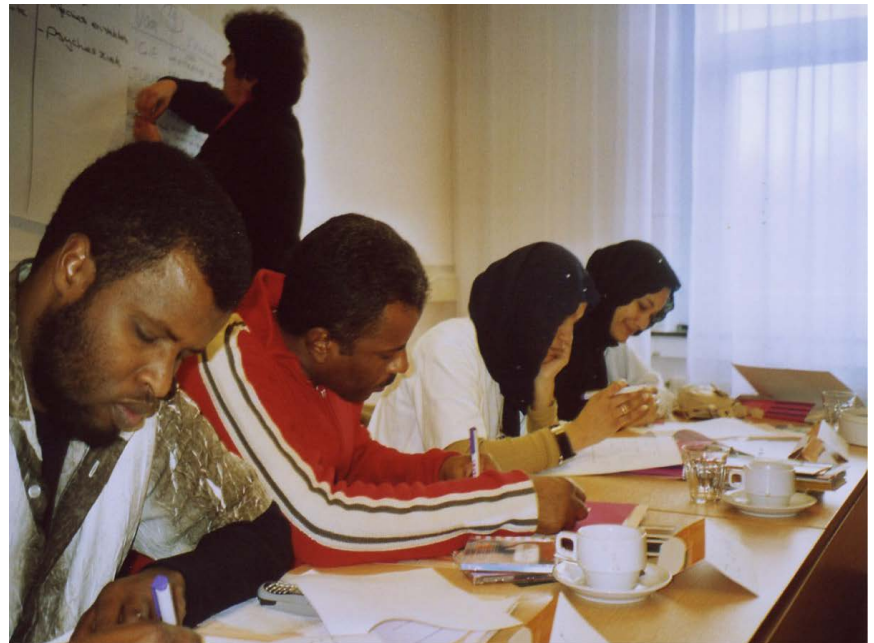
Community members participating in a training as part of FGM behaviour change intervention in The Netherlands.