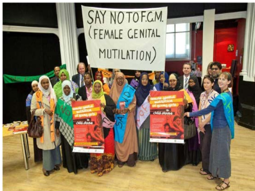
Anti-FGM campaign in UK

Excellent examples of this work are the several actions that happened last year on the celebration of the Zero Tolerance to FGM Day, on the 6th of February or the 25th of November on the International Day to